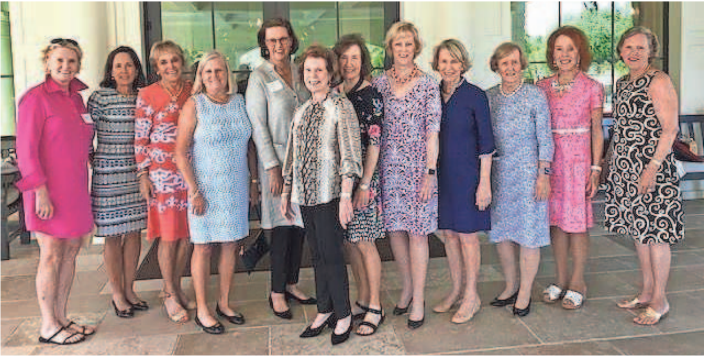
John's Island Community Service League chairs, officers and members who attended the Awards Celebration Luncheon.