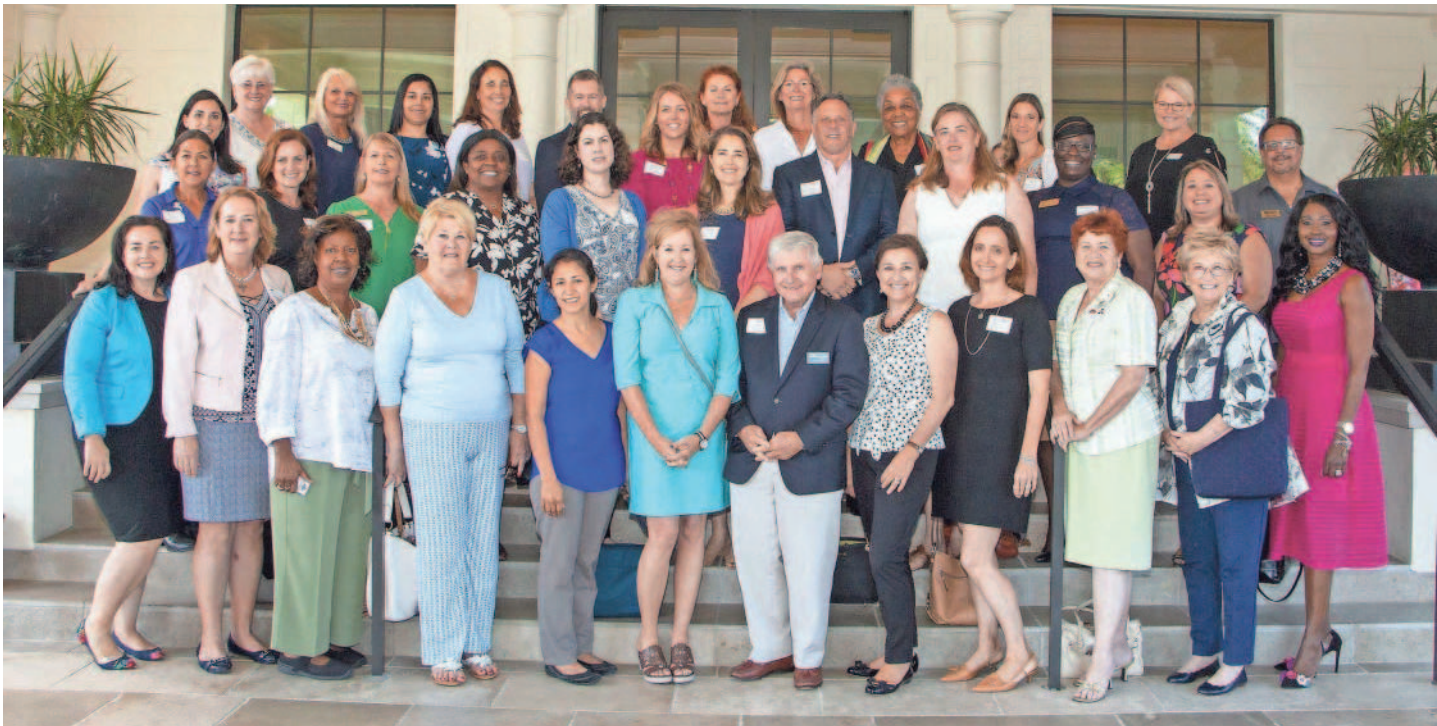
Thirty-eight Indian River County agencies were represented at the Award Celebration Luncheon.