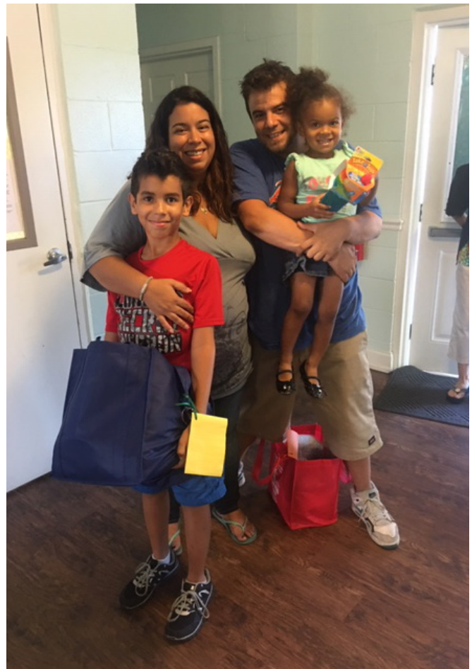
Hope for Families Center.

Converts crack houses into low income rental properties in Gifford. Initial funding was via our Strategic Fund to help them hire their first part time paid employee. In 2019 we provided funding for their first audit.