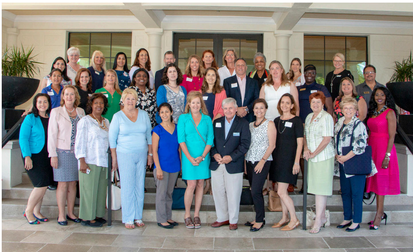
All agencies at closing luncheon.

Healthy Start provides a variety of programs to optimize the health of mothers, children and families. JICSL currently supports 3 different programs, for which we granted start up grants. They are: Parents as Teachers (PAT), a program to promote literacy and school readiness for children 0-3, Nurse Family Partnership (NFP), home visiting program for pregnant high risk teens and the Doula Program serving high-risk mothers before and during delivery.